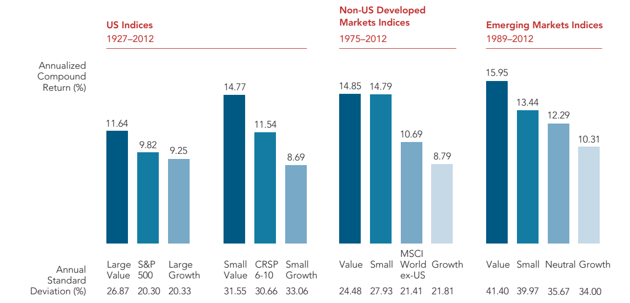
Size and Value Matter Small cap and value effects are strong around the world. Smaller and lower-priced value stocks have higher risk and greater expected returns than larger and higher-priced growth stocks.

Dimensional chooses a different path. It structures strategies based on research rather than speculation or commercial indices. Small cap strategies target smaller stocks more consistently. Value strategies target value returns with greater focus. Fixed income strategies have precisely defined term and credit risk parameters and focus on allowable ranges. As a result, investors achieve more consistent portfolio structure.